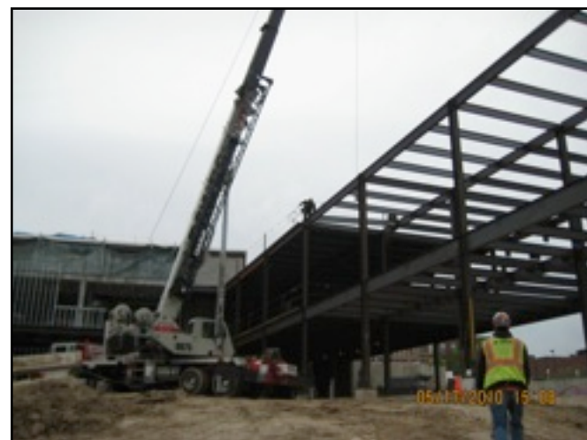
Recent construction progress pictures of the project underway on the new SCI Center

What's a monthly WPVA Membership Meeting like? Special speakers, opportunity for YOUR input, sharing ideas and hearing progress of ongoing projects that affect all members. One special thing that is done that you might want to know about in advance is the "Incentive Program." A name is chosen at random from the entire WPVA Regular Member roster. If that individual is present when his or her name is selected, they win that month's prize money. There are two chances to win this award. Check the calendar, come to the meetings, and make your voice heard!